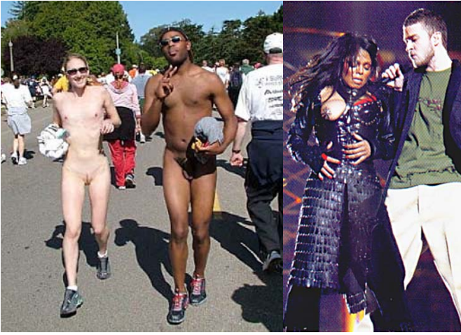
Oops, sorry, forgot a technicality Oops, sorry; malfunction

my own house. But again, I have seen some scary news stories about people arrested after they were seen through their windows. There was even a story about a couple who lost their two kids for months to Child Protective Services after taking their bath time photos to Walmart.