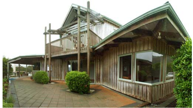
480, clothing-optional retreat.

One of the members of the non-landed clubs that I belong to is organising a naked beach fishing day a short drive north of us in early December. It is the first of hopefully what will become an annual event. Beach fishing, or surf casting is a pastime that I enjoy. It is not about catching the fish, which is a bonus if it happens, it is more about sitting on the beach and doing nothing. My success rate is not great on the times I go fishing, but I argue that is why it is called fishing and not catching. A former colleague of mine used to say that even a bad day fishing beats a good day at work. The retail price of fish in our supermarkets and fish suppliers is such that if you do manage to catch a fish, it is a bonus both from a sense of achievement and from the savings made to get a meal, although my filleting skills leave a lot to be desired.