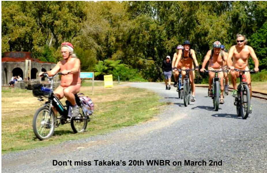
Don't miss Takaka's 20th WNBR on March 2nd