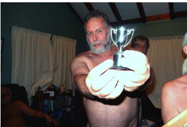
Apparently it's not the size of your trophy that counts...