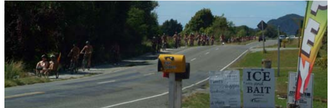
A little spread of riders on Abel Tasman Drive before...