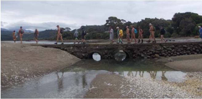
Just out of the carpark the first test: don't fall off the causeway