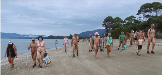
Heading off - into the unknown