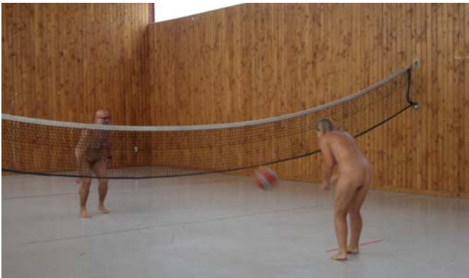
An overseas couple enjoying the large sports hall