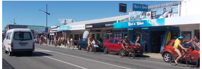
The return ride to the start doubled the amusement for shoppers