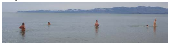
Not everyone tried the water, but those who did were enthusiastic