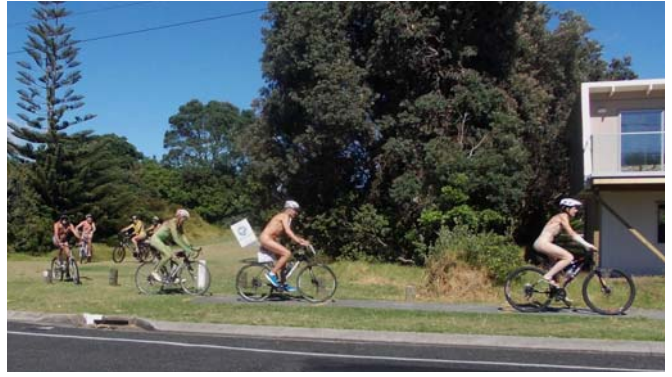
Just past the end of Waihi's houses, the riders begin their return