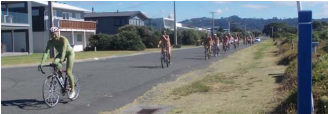
Yes there was a big, green man there