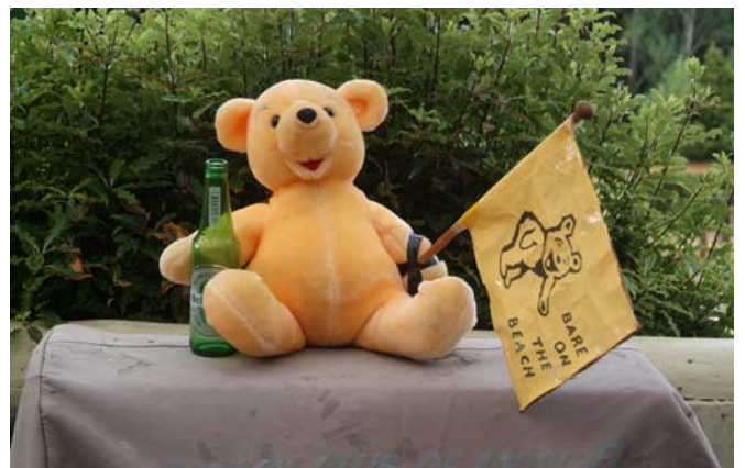
... and this angle may suggest a cause of Fred's trouble!