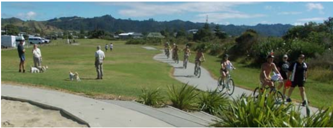
A good opportunity to surprise walkers and dogs alike