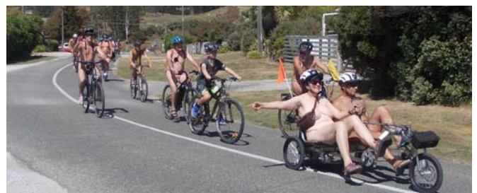
... turning into Selwyn Street, for a swim