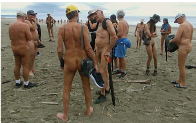
Despite the clouds the weather was comfortably warm