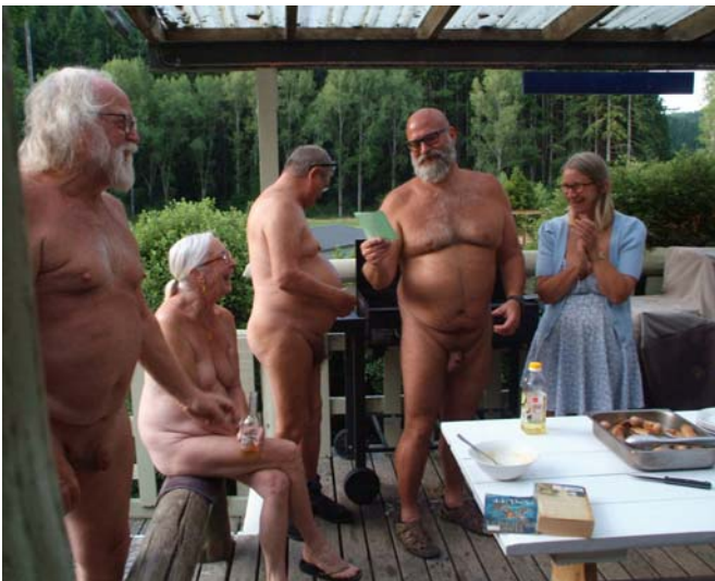
A visiting couple appreciate their (raffle?) win