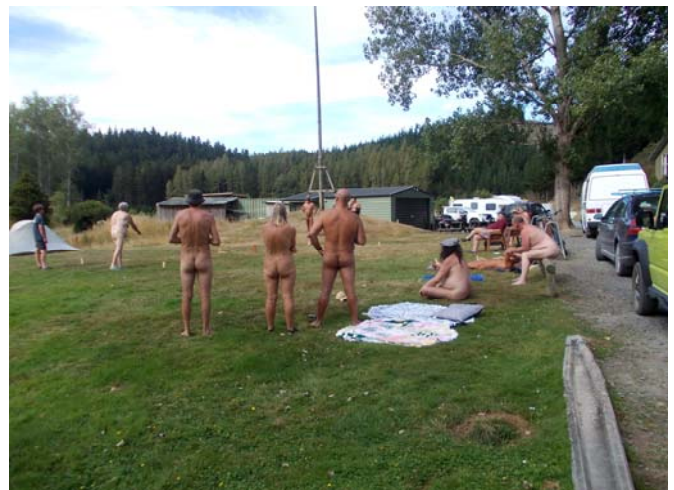
It was a long, warm, relaxing day