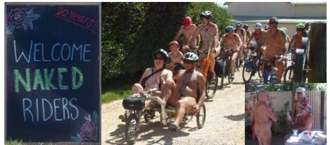
... before riding in to quench thirsts at Bryan's prize-giving