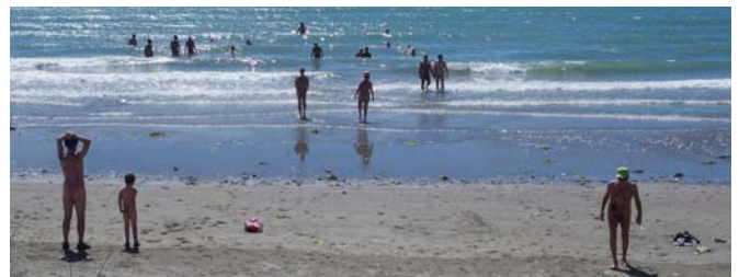
Many took advantage of the opportunity to cool off