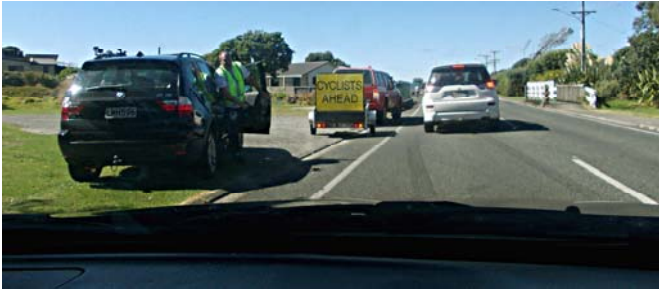
Through my windscreen I spot Matt setting up for a video