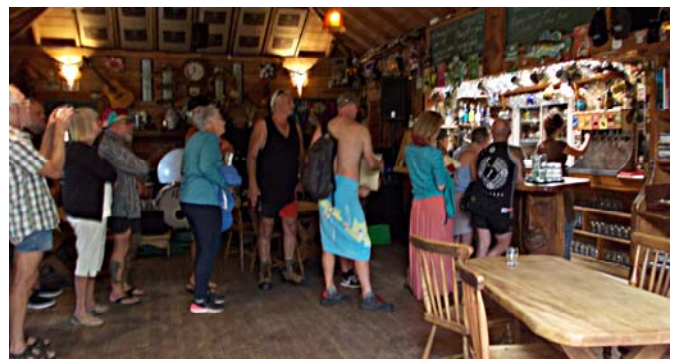
A short drive back from Milnthorpe, the Mussel Inn offered lunch...