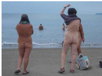
Remaining clothes abandoned