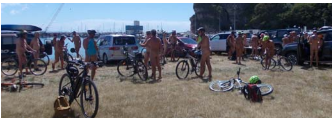
The numbers creep up as the start of the ride looms