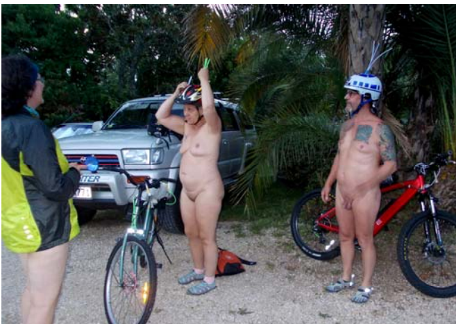
How do you dress up for night riding? With weird, lit hats