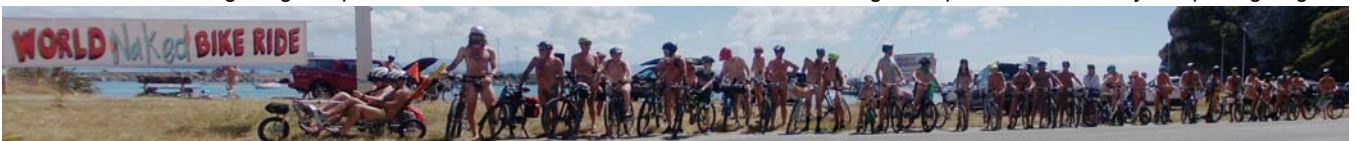
Some 33 riders pose at the starting point, in anticipation of their stopping point: the Kiwi Spirits Distillery, where their welcome awaits