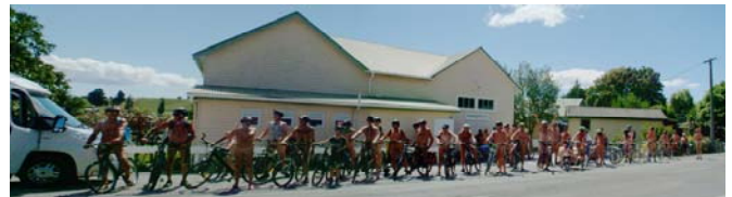
Then came the final time to line up for the photo opportunity ...