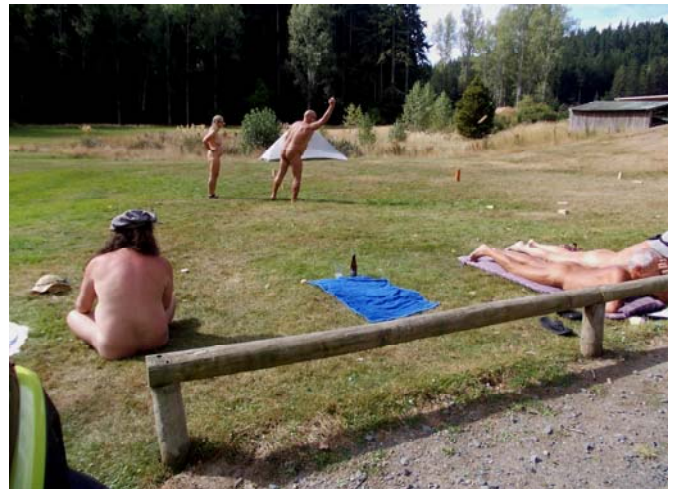
... and decides to settle in for the afternoon