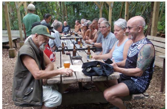
... and a pleasant, outdoor spot to eat it