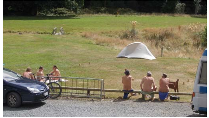
Anticipation of the possibility of a game