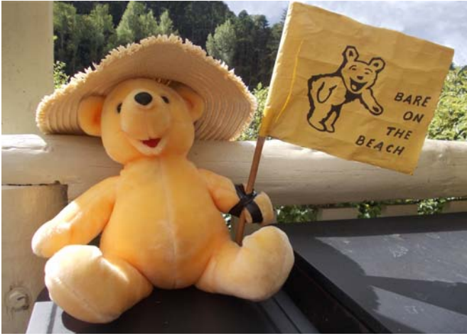
It's a new day and Fred's back on duty, despite the heat