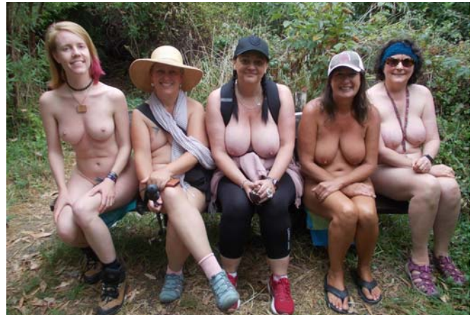
Only about half the women-walkers could fit on the bench seat

About 15 km north of Takaka we find a tiny suburb in which to stop, at the bottom of Milnthorpe Park. The park has several walking tracks in a 3km long, half kilometre wide forest, just 3km south of Collingwood.