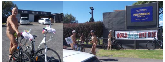
The riders return to their starting point - to dress, sadly