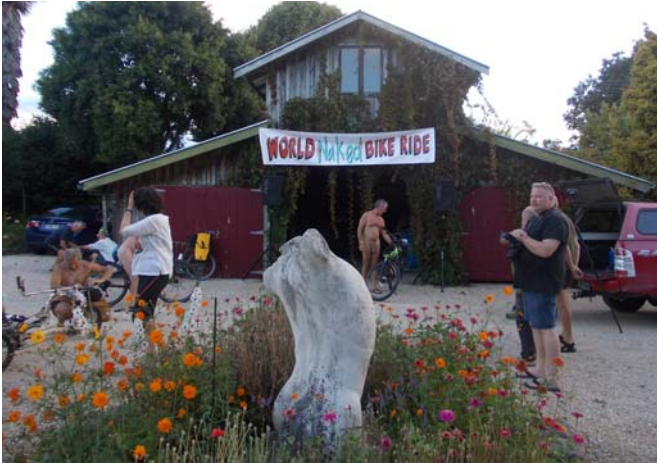
You may notice the same banner at many of these events

After the beach walk and leisurely lunch at the Mussel Inn, next it was off to Autumn Farm to set up the bikes for the inaugural night ride through town to the local beach, Rototai.